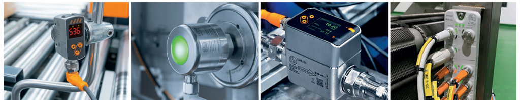
Automation Sensors / Process Sensors / Plant Network & Machine Control Systems

ifm New Zealand employs 21 dedicated local staff – committed to help you and your business succeed. We've grown steadily over the last few decades, now servicing >3,000 local businesses across NZ industry. We're proud to deliver >70% of all PO's overnight/nationwide, direct from our NZ stock!